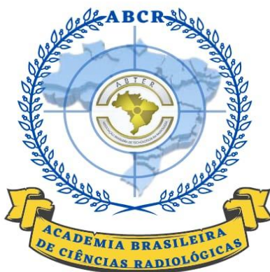
Figure 1 – Official ABCR logo

as an ornament symbolizing victory or achievement. The yellow ribbon represents optimism and joy, as well inspiring creativity and stimulating mental activities.